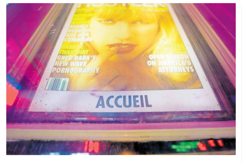
Larry Flynt's Hustler Club has filed a lawsuit seeking to overturn a ruling that the strip club's placement of 48 Hustler magazine covers on its club violate rules about signs in the French Quarter.

The lawsuit adds that the signs "are not distinguishable from displays found on the doors of the T-shirt shops neighboring the property, or the windows of antique or art dealers on Royal Street," and it says forced removal of the signs is a violation of